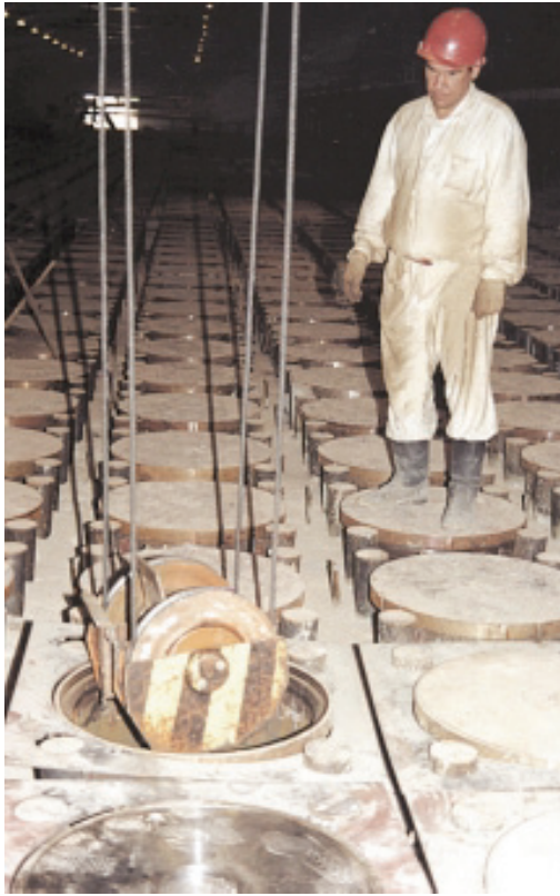
Figure 5.3. A crane at the Mayak Fissile Material Storage Facility, lowering fissile material into a ‘nest’

Note: A nest is a cylindrical space several metres in length, in which the AT-400R canisters are stacked.