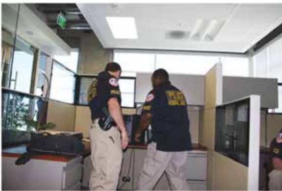
OEE Special Agents executing a search warrant.