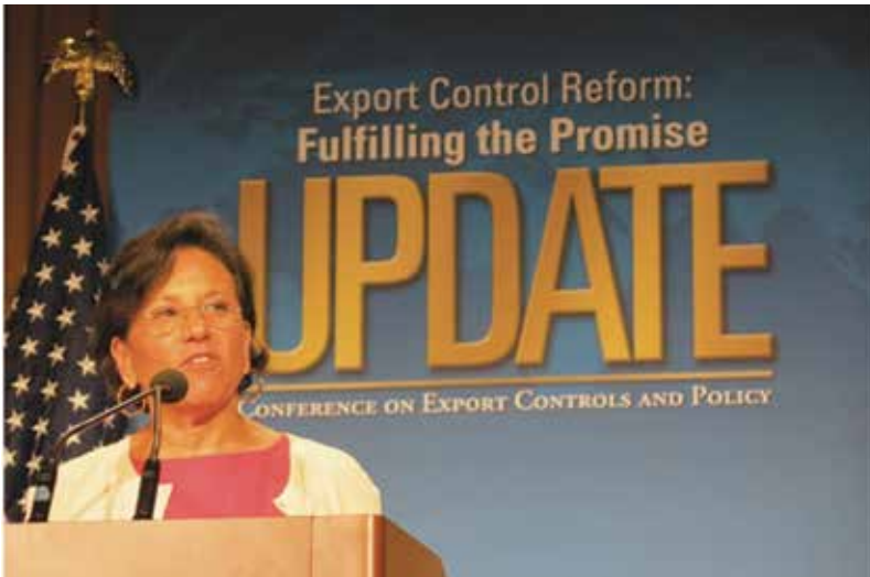
Secretary Pritzker at BIS's 2013 Update Conference describing how Export Control Reform will simplify controls on insignificant military items that have the same utility as their commercial variant, as demonstrated by certain military and commercial aircraft switches.

A party to an export transaction may be subject to criminal and/or administrative sanctions for making false statements to the U.S. Government in connection with an activity subject to the EAR. Most frequently, the false statements are made on an export document or to a federal law enforcement officer. Common types of false statements seen by BIS are statements on a Shipper's Export Declaration or AES Electronic Export Information filing that an export is destined for one country when it is really destined for a sanctioned destination, the export does not require a license (i.e., that it is "NLR") when in fact a license is required for the shipment, false item valuations and statements that an export was shipped under a particular license number when in fact that license was for a different item. False statements that are made to the U.S. Government indirectly through another person, such as a freight forwarder, constitute violations of the EAR.