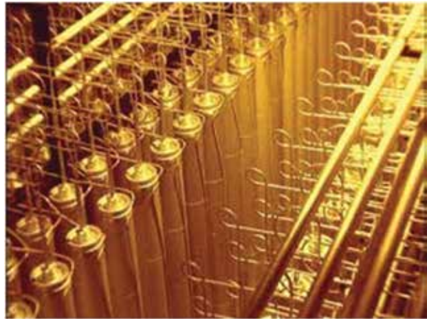
Gas centrifuges can be used to enrich uranium and are subject to nuclear nonproliferation (NP) controls.

In addition to these export control regimes, BIS controls items pursuant to multilateral treaties. These include: