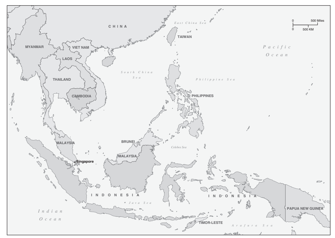
Figure 2.1. Map of South East Asia

relations with China.<sup>23</sup> As part of this policy, India upgraded its status from a 'sectoral partner' of ASEAN in 1992 to a 'strategic partner' in 2012.<sup>24</sup> India has signed defence-related bilateral agreements with various South East Asian states: Indonesia in 2001 and 2005,<sup>25</sup> Viet Nam in 2009, and the Philippines and Thailand in 2012.<sup>26</sup> However, these agreements were often in the nature of a general memorandum of understanding, and have not resulted in much more than military visits and exchanges, limited common exercises and naval patrols.<sup>27</sup>