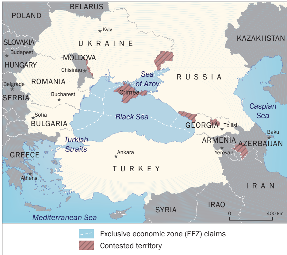
Figure 1.1. The wider Black Sea region