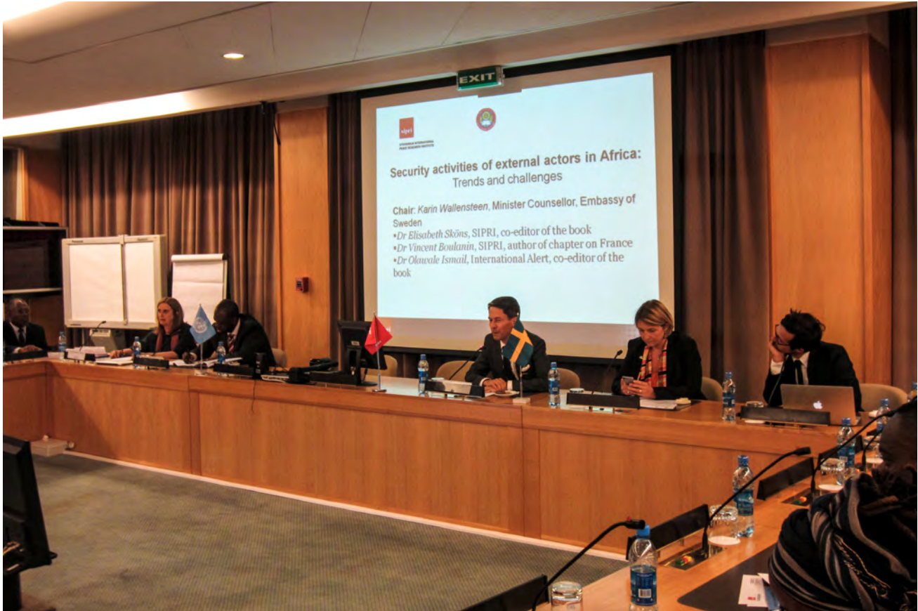
Speakers at SIPRI's book launch in Addis Ababa discuss African perspectives on the activities of external actors in Africa