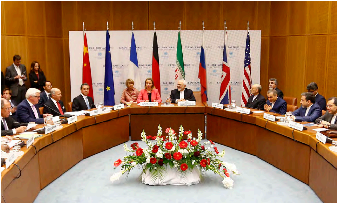
On 14 July, Iran and the P5+1 countries—China, France, Russia, the UK, the USA and Germany—reached a historical deal on Iran's nuclear programme.