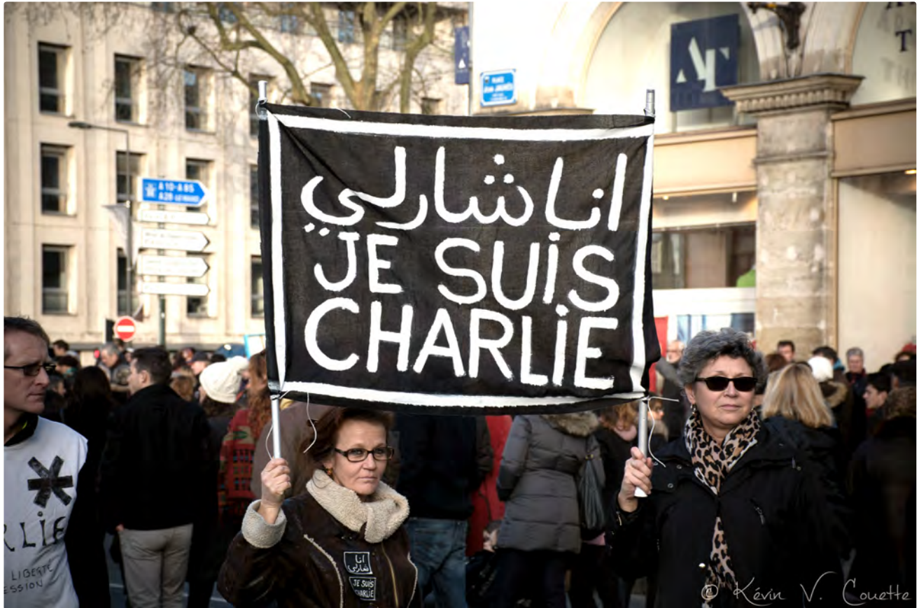
Rally in Tours, France, on 11 January 2015 after the terrorist attacks on the satirical newspaper Charlie Hebdo