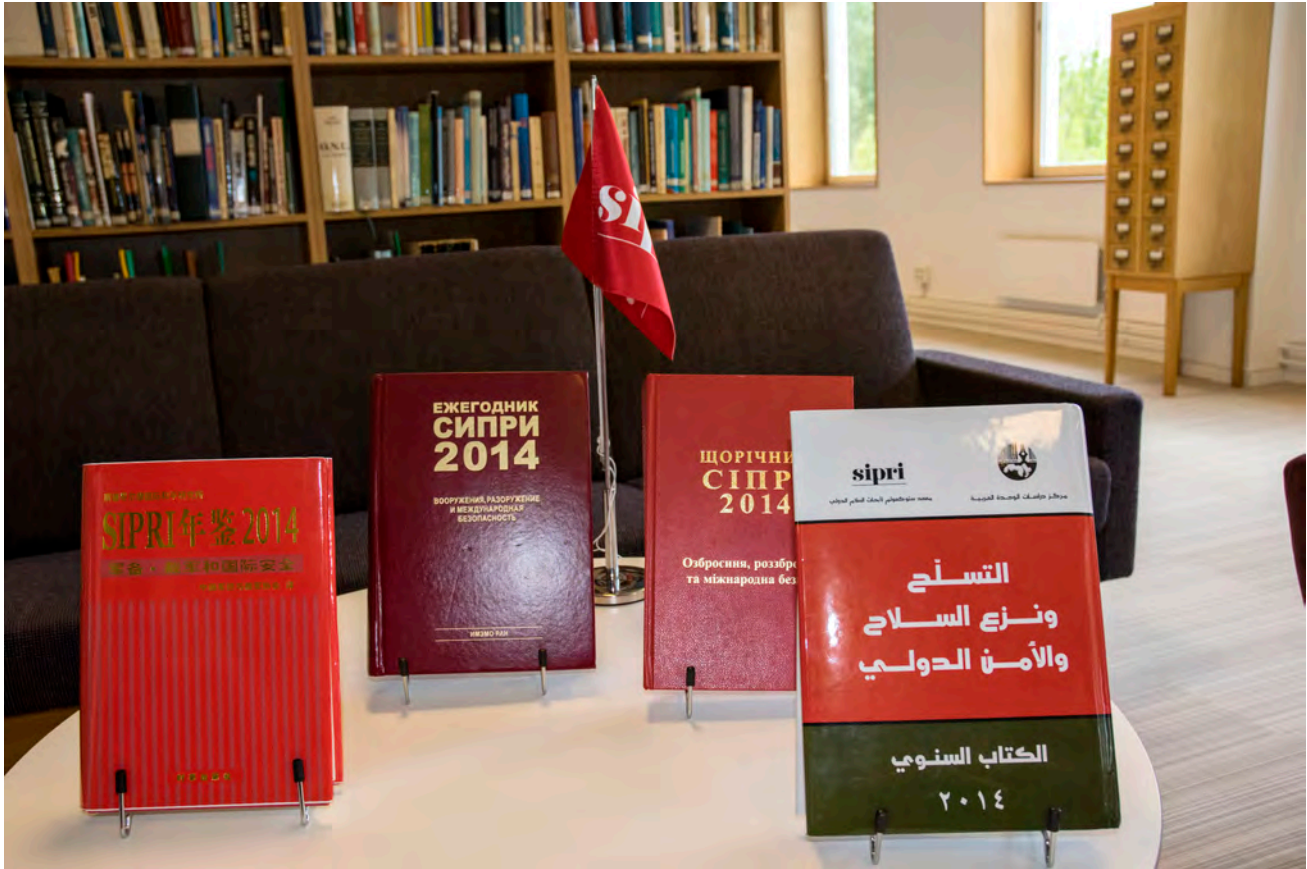
First translated in 1993, the SIPRI Yearbook has since been translated into many languages over the years