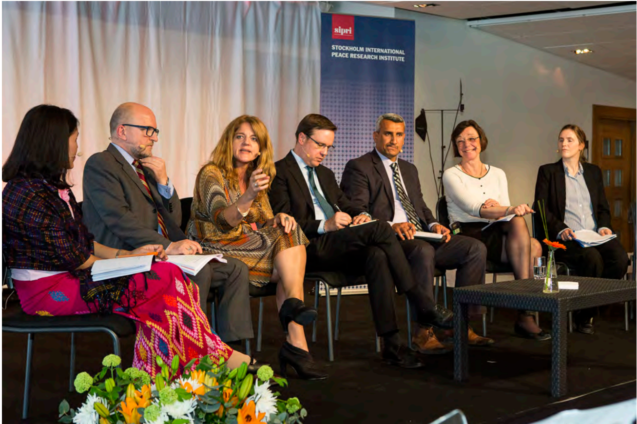
Panelists at the 2015 Stockholm Forum on Security & Development share their key takeaways at the closing session