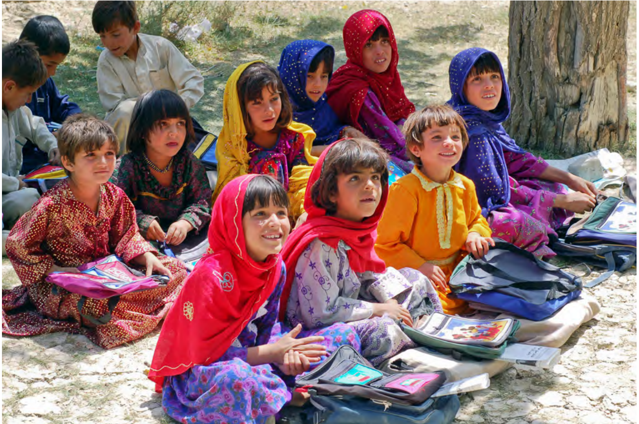
SIPRI's work in Kyrgyzstan aims to foster ethnic tolerance among young adults