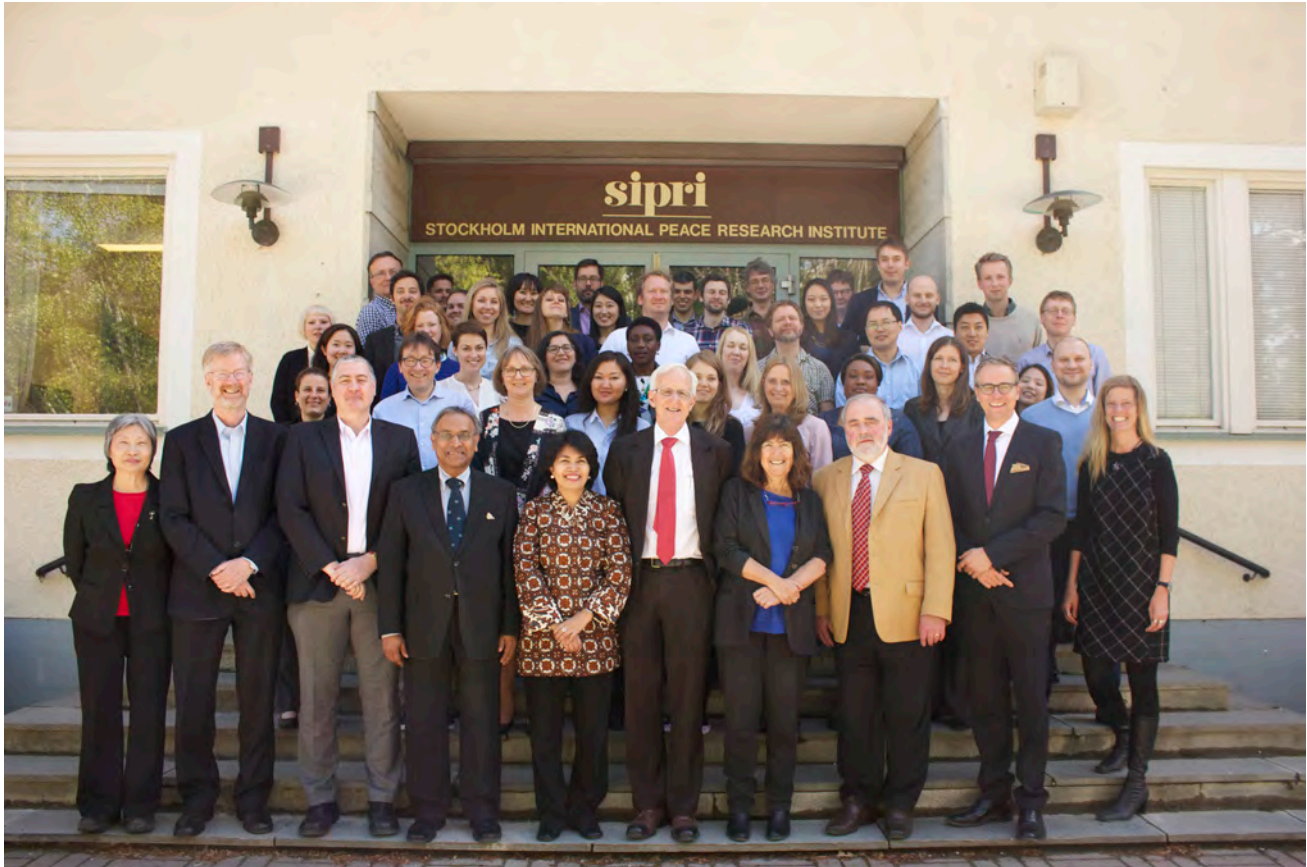
SIPRI's annual staff photo taken on the occasion of the meeting of the Governing Board